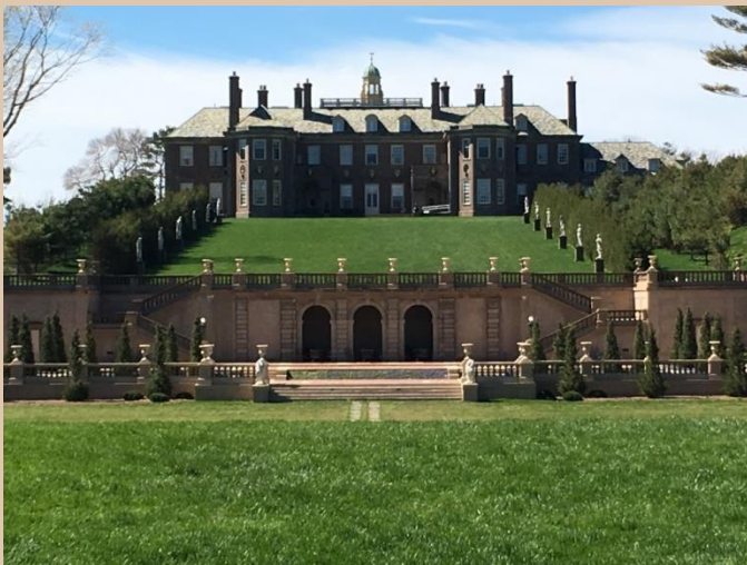
The Crane Mansion and Italianate Casino

Today the Inn is a luxury bed and breakfast with 10 rooms offering privileged access to the marshes, beaches and exquisite properties of the estate. We have been offered the exclusive use of the adjacent colonial style Tavern for lectures and reviews of work. If we reserve the entire Inn we will be in a position to offer participants a unique and exceptional painting experience.