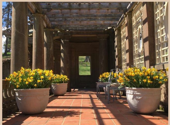
Spring in the Italian Garden