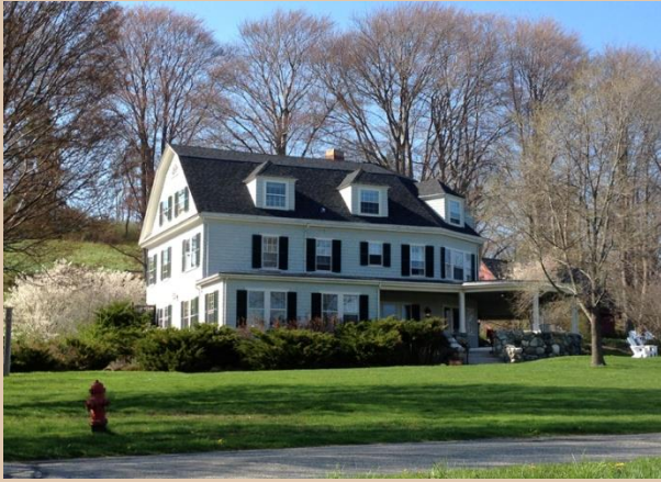
The Inn at Castle Hill