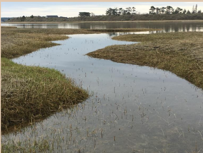
Marsh High Tide