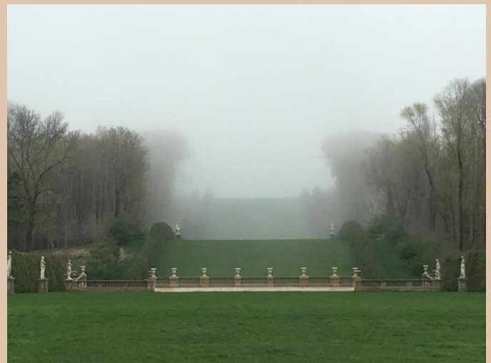
The Versailles inspired Grand Allee and distant ocean