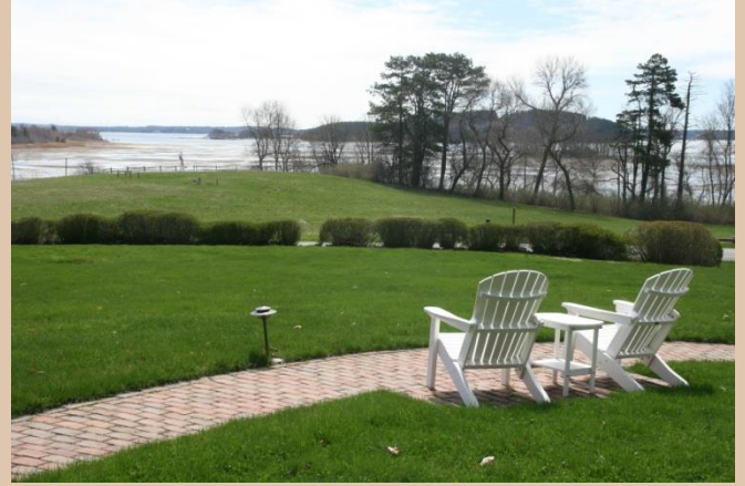
View from the Inn

Today the Inn is a luxury bed and breakfast with 10 rooms offering privileged access to the marshes, beaches and exquisite properties of the estate. We have been offered the exclusive use of the adjacent colonial style Tavern for lectures and reviews of work. If we reserve the entire Inn we will be in a position to offer participants a unique and exceptional painting experience.