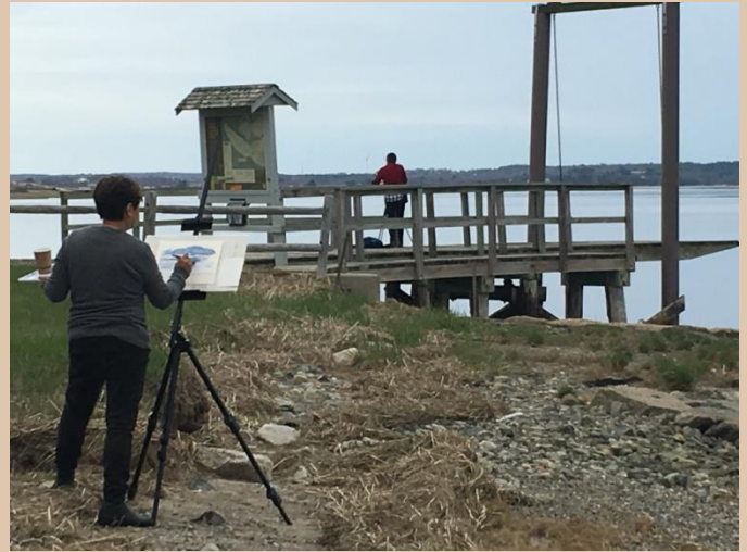
Painting at the Choate Island Ferry

Please contact us with questions at 212-780-3216 or info@landscapepainting.com .