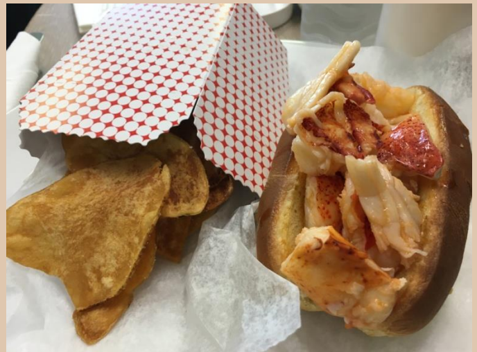
Lobster Rolls from the Ipswich Shellfish Market